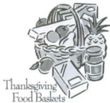
Thanksgiving Food Baskets

House. Our goal is to provide boxes of food that include: turkey, potatoes, stuffing, canned vegetables, canned yams, cranberry sauce, fruit cocktail, and dessert. Any food or cash donations will be greatly appreciated. See Fred or the sign up sheet in the Narthex. Please have all donations to the church by November 22 nd . Thank you for being a blessing to others.