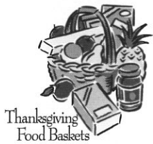
Thanksgiving Food Baskets

We are once again getting ready to provide a Thanksgiving dinner to those struggling in our area. Our goal is to provide baskets of food that include a turkey, potatoes, canned vegetables, canned yams, stuffing, cranberry sauce, fruit cocktail, oranges, and dessert. We will also be providing dinner for the families at the transitional living shelters: Amelia's Light and the Genesis Shelter. Any food or cash donations will be greatly appreciated. See the sign up in the Narthex. Please have all donations to the church before November 20 th . Thank you for being a blessing to others!